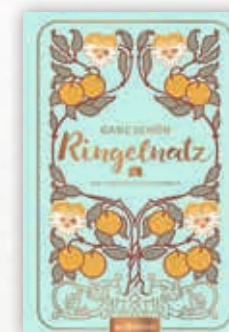
Ringelnatz ISBN 978-3-8458-2092-6