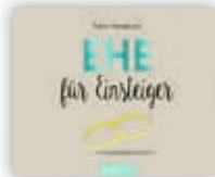
Marriage for Beginners ISBN 978-3-8458-1929-7