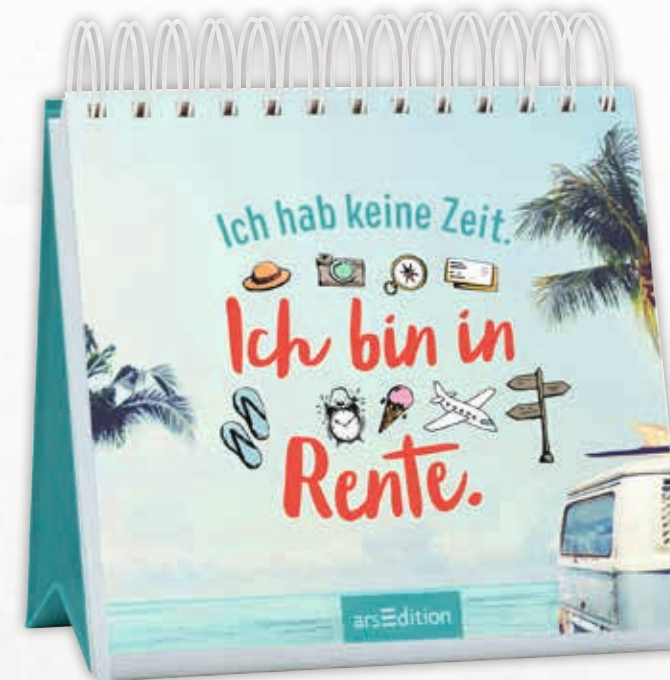
I Don't Have Time. I Am Retired. 108 pages/150 x 155 mm/€ 10,00 ISBN 978-3-8458-3102-2

Hooray, retirement! Now leisure stress begins! This book is a collection of funny sayings and illustrations, which gets you in the mood of this new stage of life.