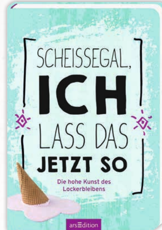
I Don't Give a Damn, I'll Leave It Like That 96 pages/124 x 178 mm/€ 10,00 ISBN 978-3-8458-2494-9

This book is a helpful and funny introduction to the highly competitive sport of chilling out. With a lot of tips and exercises about letting go, saying no, and cursing!