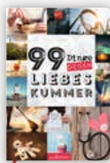
99 Things Against Lovesickness ISBN 978-3-8458-2477-2