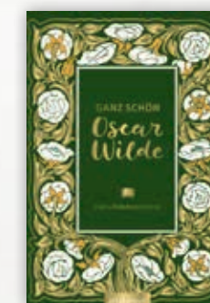
Oscar Wilde ISBN 978-3-8458-2094-6