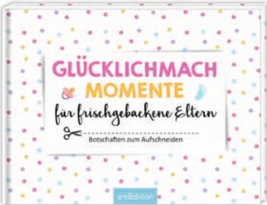
Happy Moments for New Parents 64 pages/205 x 156 mm/€ 10,00 ISBN 978-3-8458-3113-8