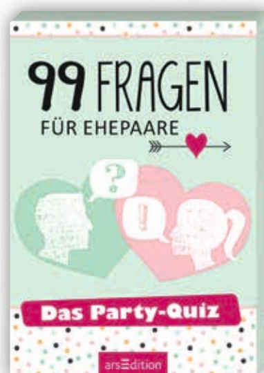
99 Questions for Married Couples 51 cards/72 x 103 mm/€ 6,00 ISBN 978-3-8458-3237-1