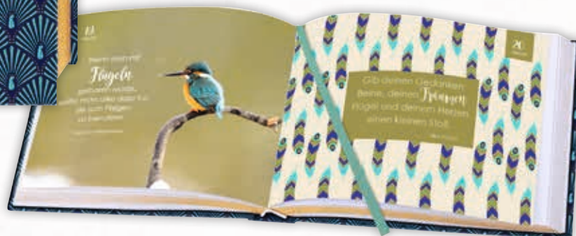
Laugh, Love, Live 376 pages/206 x 156 mm/€ 25,00 ISBN 978-3-8458-2833-6

The perfect desk calendar! Discover a gorgeous photo of a landscape and wisdom sentences everyday to help you go through the year!