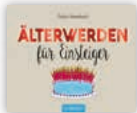
Getting Old for Beginners ISBN 978-3-8458-1932-7