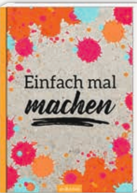
Let's Just Do It 64 pages/105 x 148 mm/ € 8,00 ISBN 978-3-8458-2683-7