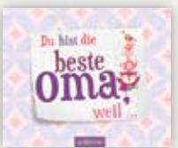
You Are the Best Grandma Because ISBN 978-3-8458-1862-7