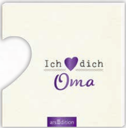
I Love You Grandma 48 pages/115 x 115 mm/€ 6,00 ISBN 978-3-8458-3085-8