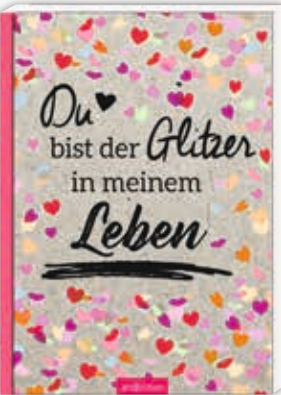
You're the Glitter in My Life 64 pages/105 x 148 mm/ € 8,00 ISBN 978-3-8458-2682-0