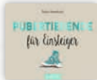
Puberty for Beginners ISBN 978-3-8458-2509-0