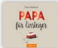
Dad for Beginners ISBN 978-3-8458-1928-0