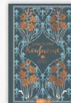
Confucius ISBN 978-3-8458-2093-6