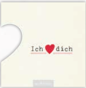
I Love You ISBN 978-3-8458-2478-9