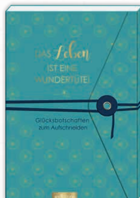
Life Is a Chocolate Box 80 pages/151 x 216 mm/€ 15,00 ISBN 978-3-8458-2834-3

Our head is always full of wishes and dreams: we should spend the next holidays here and there, should spend more time with this person, and much more... It is now time to make these dreams come true! This journal with many bullet lists will help you achieve all your dreams!