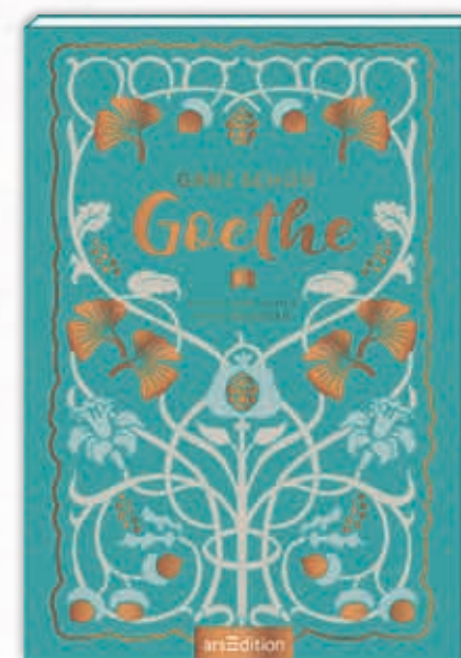
Goethe 96 pages/127 x 182 mm € 10,00 ISBN 978-3-8458-2663-9

The most beautiful thoughts, quotes and poems from well-known authors and philosophers: Goethe, Jane Austen, Confucius, Oscar Wilde... Discover more about the literary works of the most famous authors in this beautifully designed series.