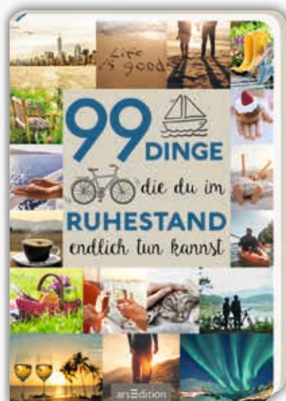
99 Things You Can Finally Do When You Retire 96 pages/124 x 178 mm/€ 10,00 ISBN 978-3-8458-3103-9