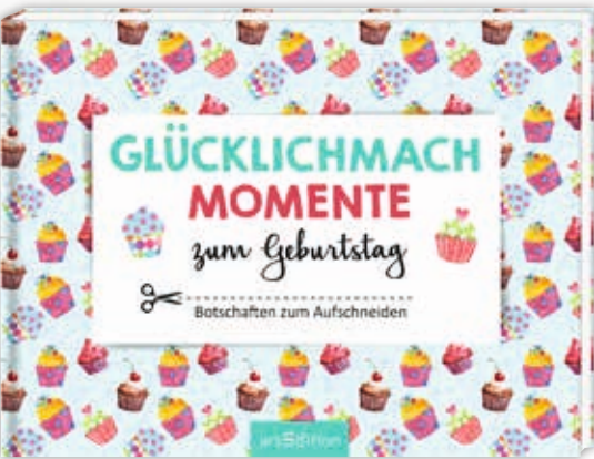
Happy Moments for Your Birthday 64 pages/205 x 156 mm/€ 10,00 ISBN 978-3-8458-3114-5

Wonderful books with pages to cut open! Every page is a new adventure and provides inspiring messages.