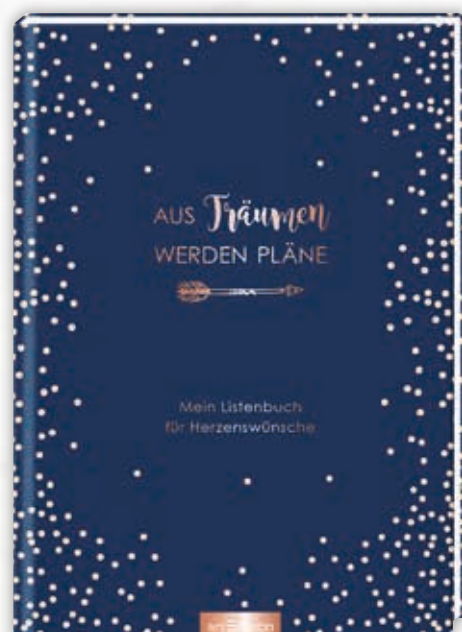
Changing Dreams into Plans 144 pages/154 x 216 mm/€ 15,00 ISBN 40-14489-11941-8

Our head is always full of wishes and dreams: we should spend the next holidays here and there, should spend more time with this person, and much more... It is now time to make these dreams come true! This journal with many bullet lists will help you achieve all your dreams!