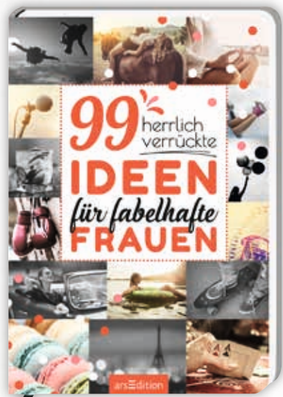
99 Wonderful Crazy Ideas for Fabulous Women 96 pages/124 x 178 mm/€ 10,00 ISBN 978-3-8458-3099-5