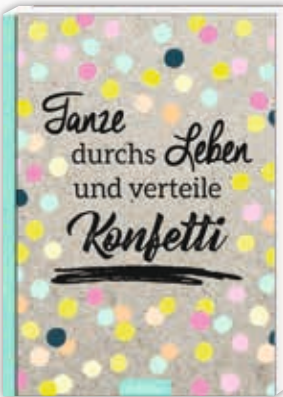
Dance through Life and Share Confettis! 64 pages/105 x 148 mm/ € 8,00 ISBN 978-3-8458-2681-3

On every page of this unique gift book are nice little love messages to offer to the one you love!