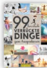
99 Wonderful Silly Things to Try ISBN 978-3-8458-1910-5