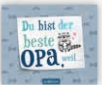
You are the Best Grandpa Because ISBN 978-3-8458-1863-4