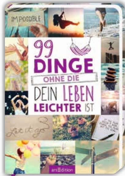
99 Things Your Life Is Easier Without 96 pages/124 x 178 mm/€ 10,00 ISBN 978-3-8458-3080-3