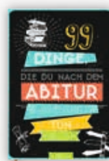
99 Things You Should Do After Your A-Levels ISBN 978-3-8458-1918-1