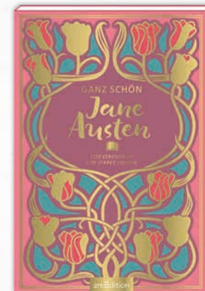
Jane Austen 96 pages/127 x 182 mm/€ 10,00 ISBN 978-3-8458-2664-6