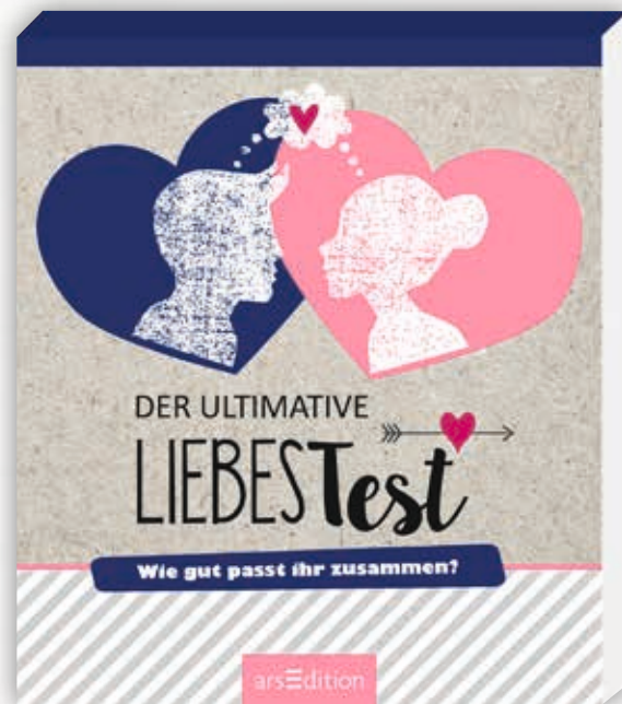
The Ultimate Love-Testing 100 pages/153 x 175 mm/€ 7,99 ISBN 978-3-8458-3082-7

Love doesn't have to be perfect, but real. Are you two a good match? These titles contain many funny, profound and exciting questions to get to know each other even better while having fun!