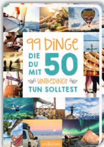
99 Things You Need to Do When You're 50 96 pages/124 x 178 mm/€ 10,00 ISBN 978-3-8458-2856-5 Sold to: The Netherlands