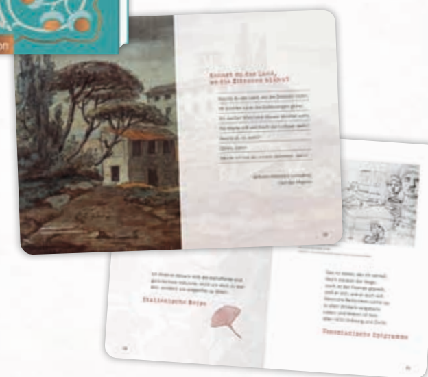
Each title: 96 pages/127 x 182 mm/€ 10,00 ▼