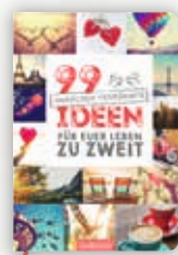
99 Wonderful Silly Ideas for Your Life Together ISBN 978-3-8458-2504-5