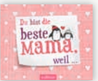
You Are the Best Mom Because ISBN 978-3-8458-1861-0 Sold to: Brazil