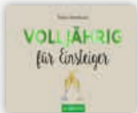
Coming of Age for Beginners ISBN 978-3-8458-2691-2