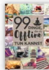
99 Things You Can Do Offline ISBN 978-3-8458-2759-9