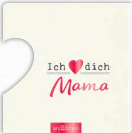
I Love You Mom 48 pages/115 x 115 mm/€ 6,00 ISBN 978-3-8458-3084-1

On every page of this unique gift book are nice little love messages to offer to the one you love!