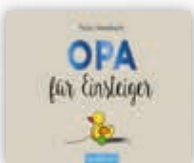
Grandpa for Beginners ISBN 978-3-8458-1931-0