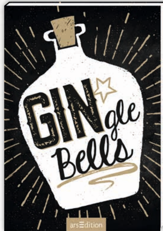
GINgle Bells 48 pages/108 x 151 mm/€ 8,00 ISBN 978-3-8458-2868-8

Discover Christmas recipes and funny sayings around gin to help you survive the winter! A perfect Christmas gift for friends or for oneself!