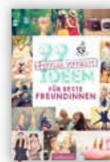
99 Crazy Ideas to Realize with Your Friends ISBN 978-3-8458-2806-0