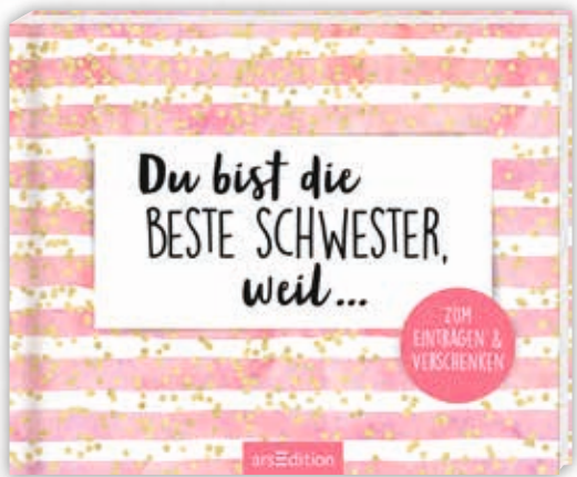
You Are the Best Sister Because... 48 pages/154 x 127 mm/€ 6,99 ISBN 978-3-8458-3086-5

There are many reasons for saying 'You are the best!'. In this little book you can write down memories with your sister and what you like about her. But there are also inspiring quotations on this topic – the perfect mixture between personal thoughts, wishes and proper quotations.