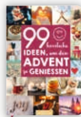
99 Wonderful Ideas to Enjoy Advent Season ISBN 978-3-8458-2208-2