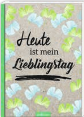
Today Is My Favorite Day! 64 pages/105 x 148 mm/ € 8,00 ISBN 978-3-8458-2684-4