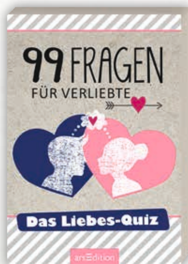
99 Questions for Lovers 51 cards/72 x 103 mm/€ 6,00 ISBN 978-3-8458-3238-8