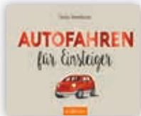
Driving for Beginners ISBN 978-3-8458-2510-6

Each title: 48 pages/154 x 127 mm/€ 6,99 Sold to: The Netherlands