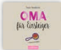
Grandma for Beginners ISBN 978-3-8458-1930-3