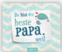
You Are the Best Dad Because ISBN 978-3-8458-1864-1